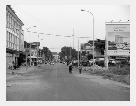
Fig. 4: Real estate development in the suburbs.