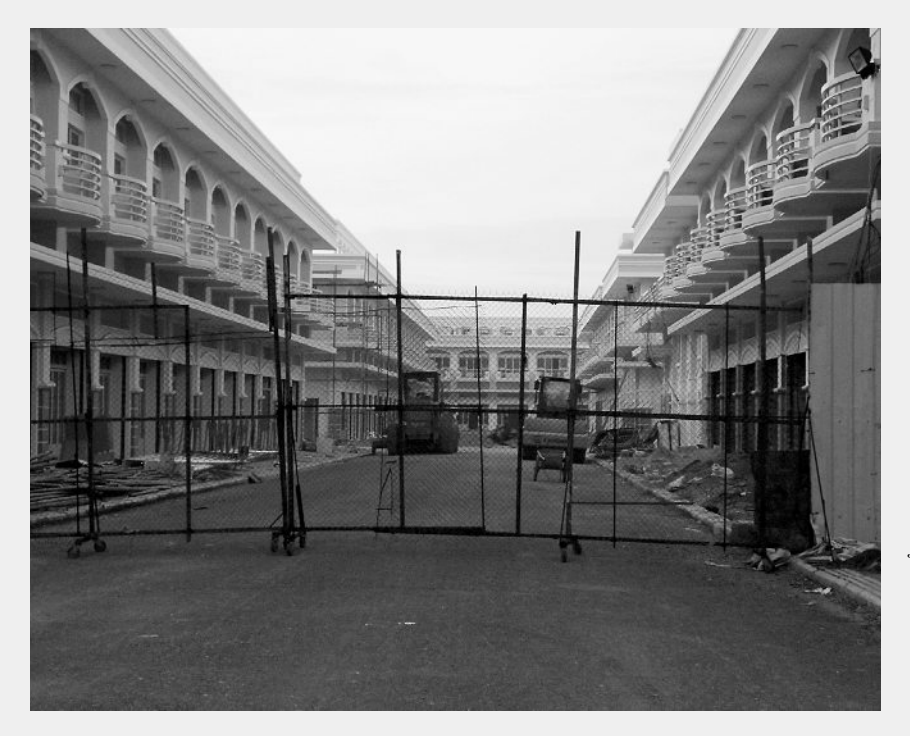
Fig. 10: "Walk the line": Recent real estate development.

(10%) and a private developer (90%), based on a 99-year-leasing agreement. It poses a serious threat to the livelihoods and economic existence of the lake residents, totalling approximately 4200 families. They are going to be resettled far from the city center and sometimes compensated below the market value of the land - if they get paid at all. The surroundings of the lake are part of the 133 hectares urban restructuring area. Environmental impact assessments or consultations with affected people have never been implemented adequately.