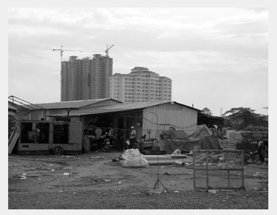
Fig. 5: Money and ambition: High-rise condominium units in central Phnom Penh, waiting to be sold to foreign investors.