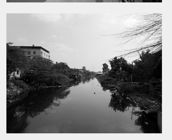
Fig. 6: Artificial land making: Partly filling-in of the Boeung Kak Lake.