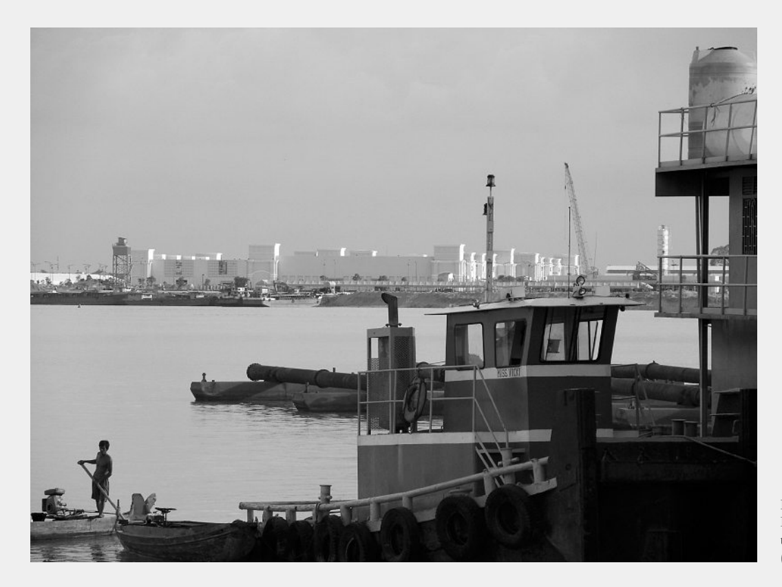
Fig. 12: Brave new world? Real estate development on the Mekong riverside.

conclusions. First, the problems occurring in today's Phnom Penh that seem at first glance to be a problem of land dispute resolution, legal enforcement, and insufficiently compensated evictions and expropriations have mainly to do with the creation of private property rights. Second, in a broad absence of a developed civil society - something which Cambodia shares with other post-conflict countries - the structural feature of the "elite capture of law" has led to a distribution of nearly all lands in favor of the elite coalitions. Third, urban land redistribution as reparation had a difficult start from the beginning of the land reform process after the Khmer Rouge regime. A serious lack of commitment of the government bodies to respect existing land legislation is obvious. Governing structures based on the creation and conceptualization of private property rights, enforced by external authorities and international "advisors", are neither always necessary nor optimal. Property and land value taxation will eventually become an important source of the municipality's revenue. Taxation must be flanked by a modern land inventory and transparent leasehold agreements for the sake of the inhabitants. Hopefully, relevant thinking is continuously evolving amongst the capital's planning and land distribution authorities.