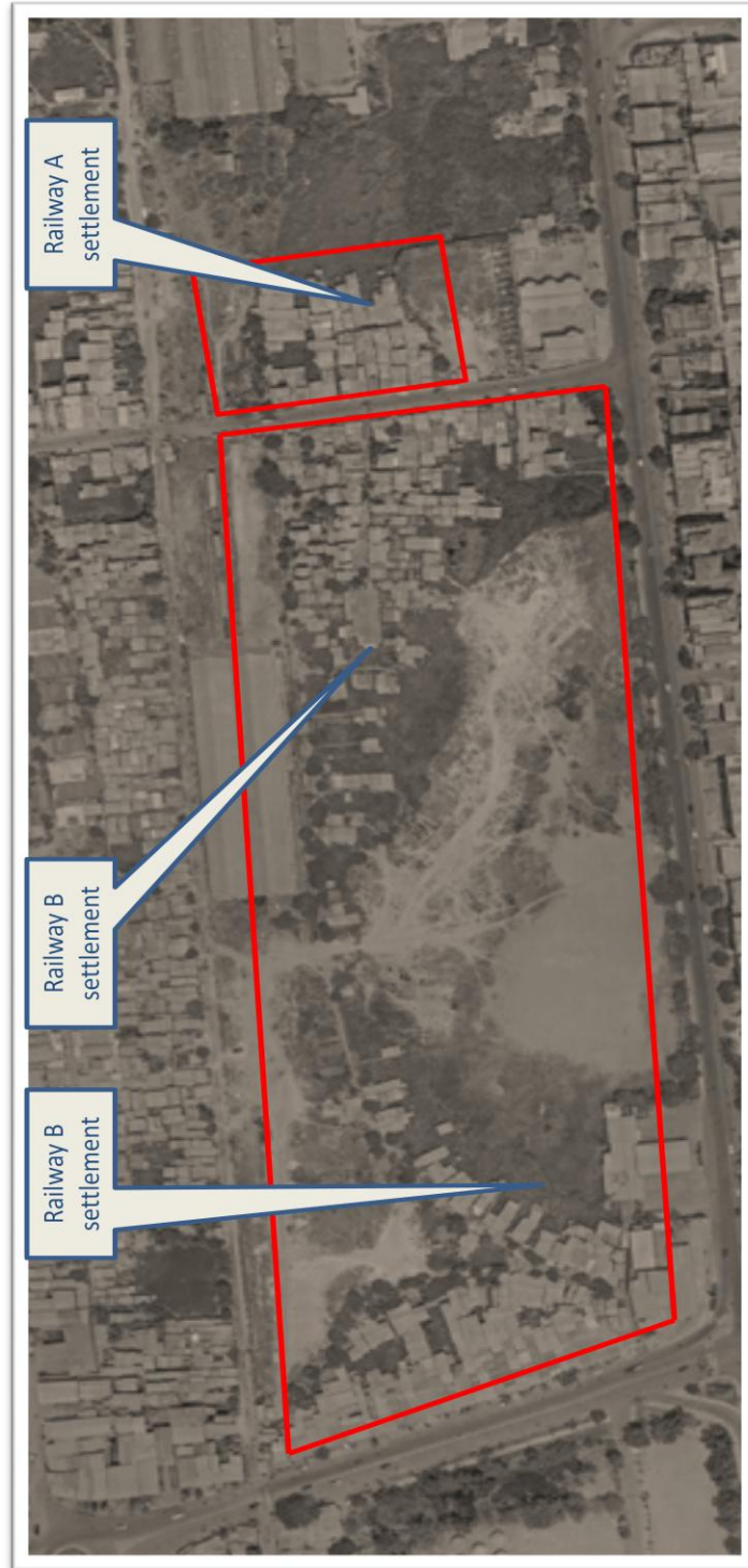
Figure 5: Orthophoto of Railway A and B settlements

Flying scale: 1:7000 / Date of orthophoto: February 2005.