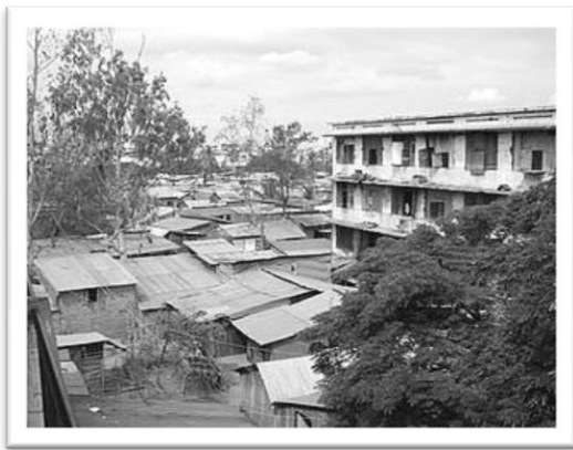
Original apartment blocks, built for athletes in 1966, now crumbling and surrounded by shacks (Author's photo, January 2006)

would revert to the Ministry of Education, Youth and Sports, although this area was later sold to the private developer as well. The developer agreed to invest over US$ 7 million for the construction of ten six-storey walk-up apartments to re-house the residents. Each apartment unit would measure 40 square meters; there would be 29 individual, serviced apartment units per floor. The company was responsible for building temporary housing for those residents displaced by the construction. In addition to the buildings, the company was to construct a bitumen road of 400 meters, to connect the new community housing to the main road.