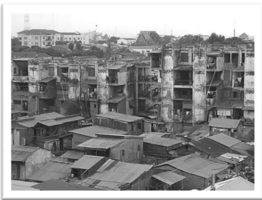
The rooftops of Dey Krahom, in the foreground, with the “Boding” apartment block in the background

accepted an offer from a private company that promised to provide each family a one-storey concrete house of 40 square meters, along with basic utility connections, on a 50 hectare site owned by the company, located 20 km from Phnom Penh. Though the new site was still quite remote and far from employment opportunities, the developer pledged to construct a paved road connecting the new site to the main road, and assured the leaders that a garment factory would be built right next to the new site that would create 500 jobs for community residents. In addition, the company promised to deliver the following on-site facilities: a market, two pre-schools; a health post, a community office; a village office; and two buildings to be used as training centers. During the first five years, residents would obtain temporary land titles issued by the company. After five years, they could apply for regular land titles with the local authorities. In addition to the houses for the Dey Krahom population, the new site would accommodate hundreds more apartments in more expensive price categories. Proceeds from the sale of these commercial apartments would be used to finance the construction of housing for Dey Krahom families. In return for the free housing, all residents were expected to vacate their properties in the old site in the city center and turn over the land to the company.