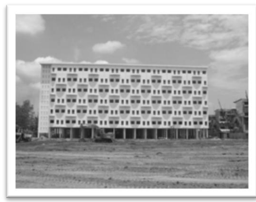
One of three new community buildings inaugurated in Borei Keila in early 2007