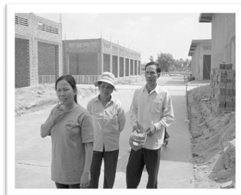
In the relocation site, a family preparing to relocate inspected the new housing being built for them (Author’s photo, January 2006)