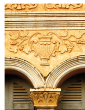
Shop House Detail