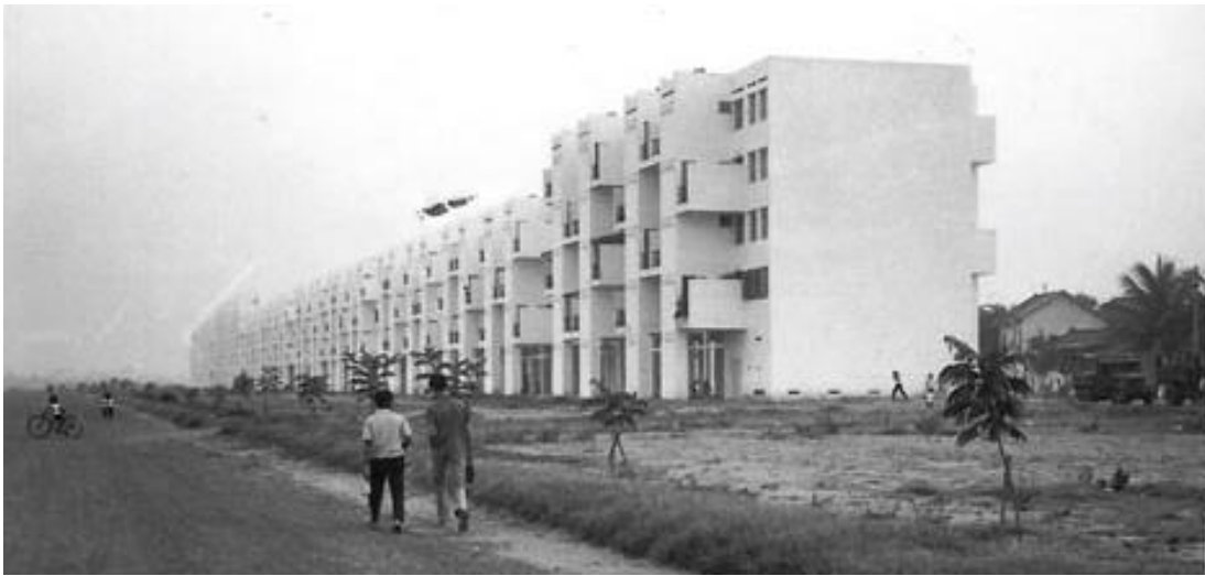
The White Building soon after completion, 1965