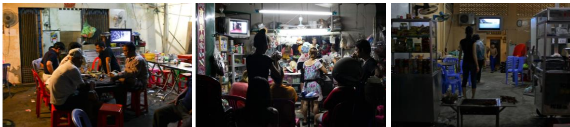
L-R: TV playing Aziza students film in the chess café; in the hairdressers; restaurant

This program was the most substantial engagement with public and shared spaces in and around the Building. The Sa Sa gallery hosted an exhibition, however other spaces also became exhibition spaces. Video installations were placed in numerous businesses on the ground floor. A local café became a cinema showing films made by the film school participants, as well as films by Cambodian and international filmmakers, and one of the Aziza School classrooms became the site for a multi-screen installation work. Most of the films that were featured in the café cinema over the course of a 7-day mini film festival were focused on people from the Building and life in and around the Building. Participants in the films and the filmmakers presented and discussed their stories. As many stories, materials and other resources as possible that were available within the community were used in staging the program. Video works that were produced were played on TVs and DVDs borrowed from individuals and businesses throughout the Building. The cinema screen was made by Aziza School students, graphic design was done by Building based designers, promotion of the event within the Building community was by community members who were also guides for outside guests enabling them to navigate the different sites of the exhibition. Even community clean up and maintenance works were organised by community members.