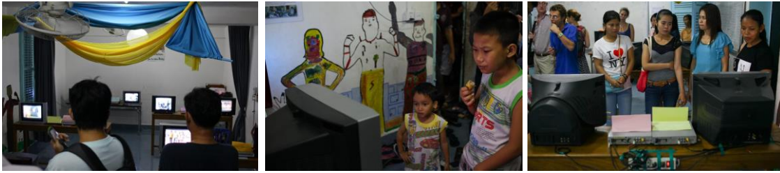
L-R: detail of 11 channel video installation at Aziza; children watch a story; reverse of classroom