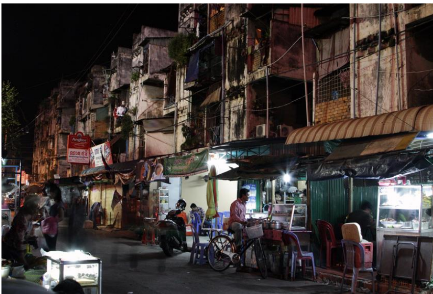
The Building, 2014.