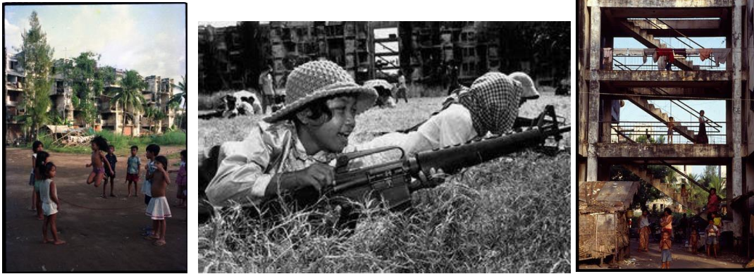
L-R: 1991, children play outside the White Building, 1993, village children in militia training, residents on the stairs of the White Building, 1991