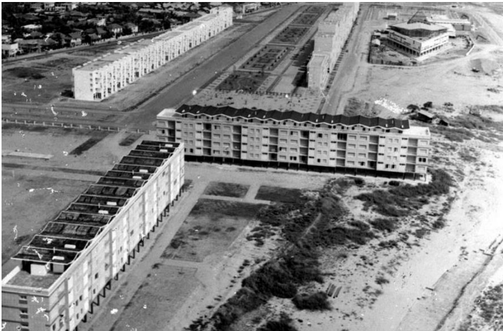
Aerial view of the Bassac Riverfront development, c. early 1965. Top left is the White Building. Top right is the triangular Bassac National Theatre (burnt in 1994 and demolished in December 2007). The Grey Building has now been completely transformed and is now unrecognizable as the Phnom Penh Centre. The two long apartment buildings in the bottom left and centre of the image are now used by the Russian Embassy as accommodation for embassy staff and military.

Given that abstract space is buttressed by non-critical (positive) knowledge, backed up by a frightening capacity for violence, and maintained by a bureaucracy which has laid hold the gains of capitalism in the ascendant and turned them to its own profit, must we conclude that this space will last forever? (Lefebvre, 1991, p. 52)