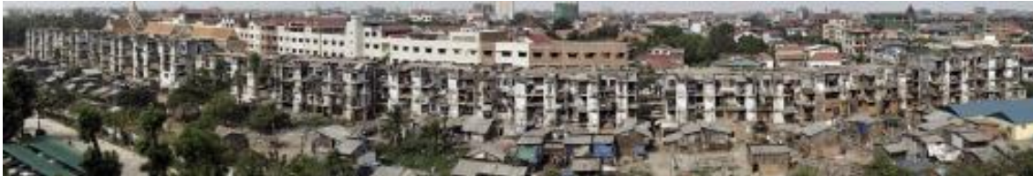
Panorama of the White Building, 2007. By Tadashi Ono

schooling for their children and none of them with access to local markets. (Cambodian League for the Promotion and Defense of Human Rights, 2009b; LICADHO-Canada, 2008; Shozi, 2014). From inner-city living to the margins of society in a day. The widespread demolition or substantial reconstruction of the Bassac Front development is part of a wider pattern of neoliberal accumulation and spatial reckoning (in the city).