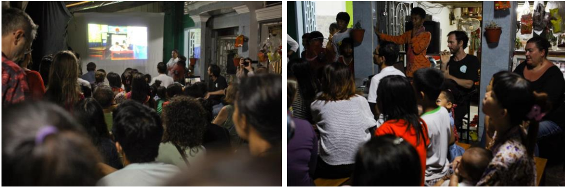
L-R: the café cinema