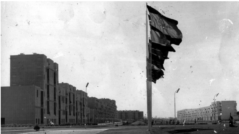
The Grey and White Buildings, 1966

Consider, then, this influence in the Cambodian context of the 1950s and early 1960s where a modernising desire existed within a newly independent setting that was also