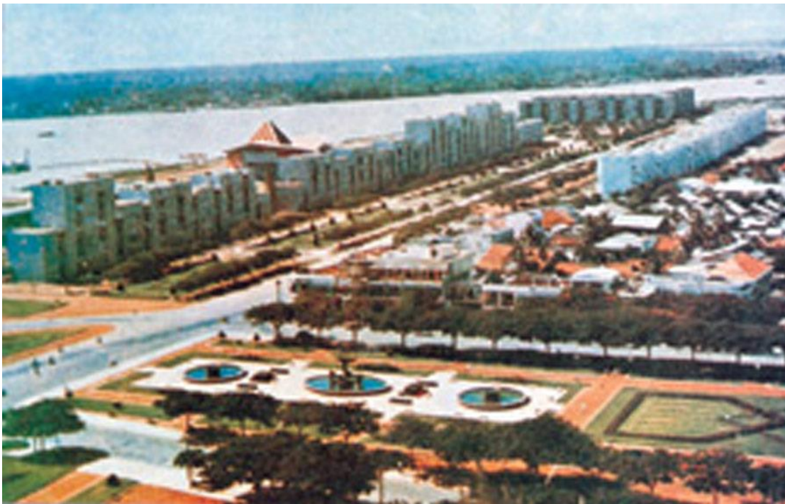
Rare colour photo of White Building (top right), Grey Building and the iconic pyramid roof of the Bassac National Theatre behind, c. 1966.

entwined with utopian desire and reactionism. This reactionism was in response to the rapid urbanisation and the post-France, post-colonial experience of independence. Despite the universalising pressure of the dominant discursive practices of an expansionary modernist and capitalist outlook, Vann Molyvann's influence exuded distinctly Cambodian characteristics. The backward glances and an imagined utopian modern city merged to form an ideological frame that was evident in the idealisation of Cambodian village life (Chandler, 1984) and in the Sihanouk government's utopian vision of a new Golden age of Cambodia harking back to the Khmer Angkorian empire (Falser in Wintle, 2015, p. 150). Importantly, this historically based idealisation and utopian vision is set within the frame of traditional Cambodian power relations based on the patronage paradigm of power distribution in society (Vickery, 1999; see also Un & Hughes, 2011).