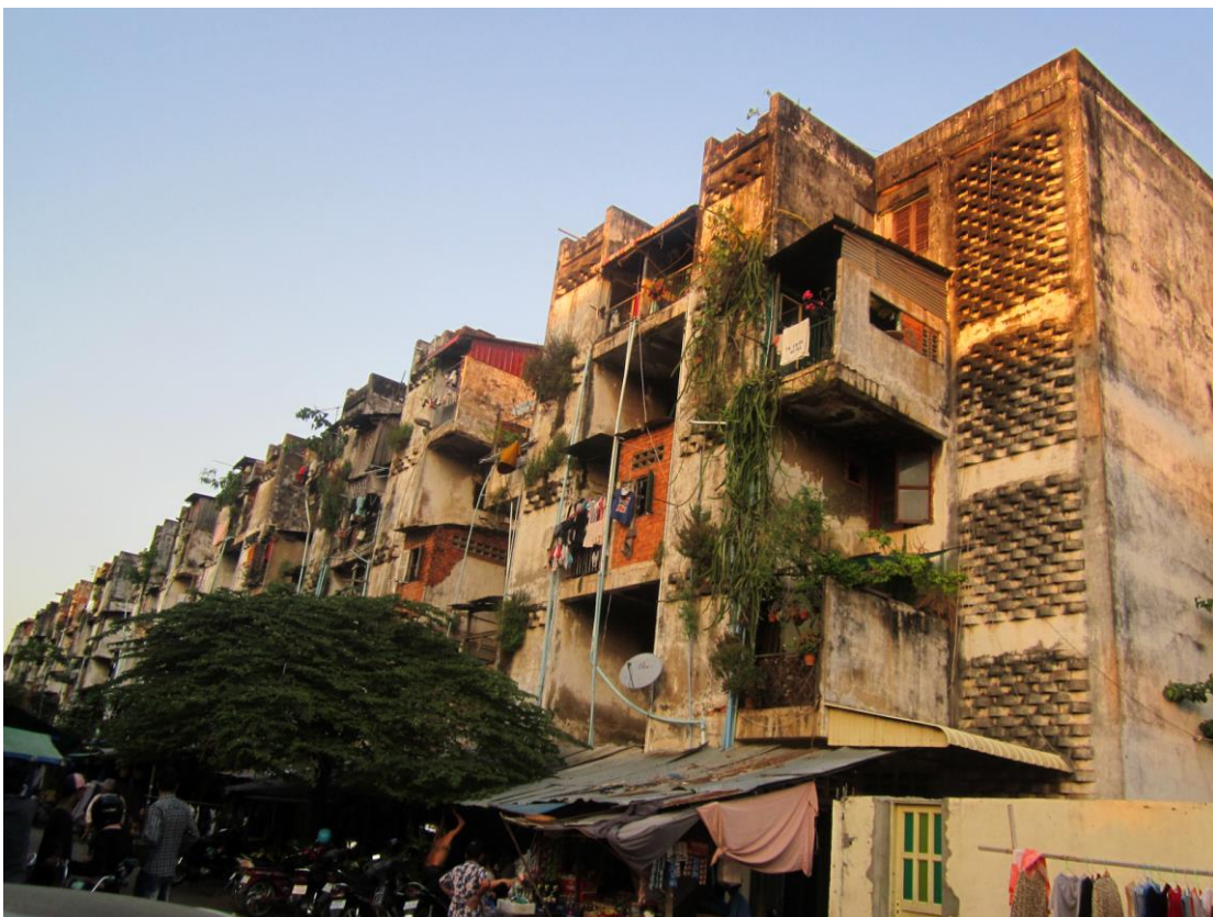
The White Building, Phnom Penh, 2012.

across a variety of mediums and media platforms – including the very successful Humans of Phnom Penh series, whitebuilding.org and the Sa Sa Art Projects artists' collective based in the building – there is a desire to not only celebrate and document the living memory of this unique community, but to push back against government and property developers' interest in the site. By utilising a Lefebvrian analysis we argue, first, that the dominant discursive acts of the more powerful can be challenged through the expression of the 'lived' and the elevation of everyday life. And, second, we argue that the very perception of the space and the sense of place is (re)produced through these interactions across these new and diverse mediascapes.