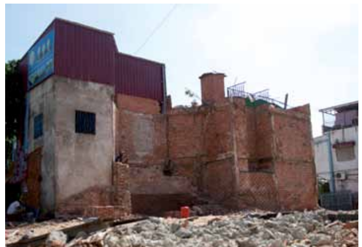
Demolished Ministry of Industry, Mines and Energy

44 The old Ministry of Industry, Mines and Energy was on the corner of Norodom Boulevard and Street 108. See map on the back cover.