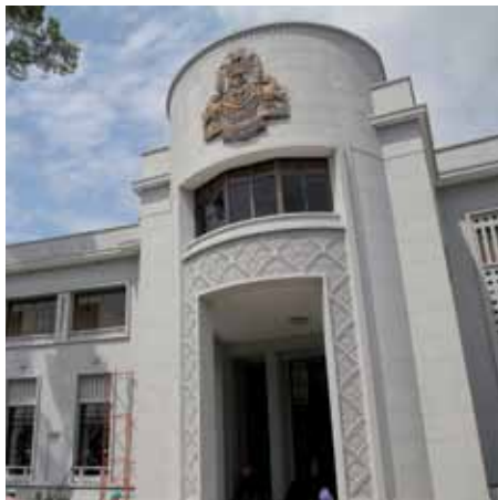
Council for the Development of Cambodia

The Protectorate government used the building as an office for the Résident Supérieur du Cambodge, who was in charge of administering the country. King Norodom Sihanouk had given the lot to the French government as a land concession. "CDC is considered