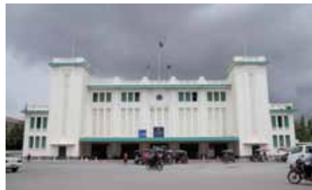
National Train Station

The train station is the first impression of the visitor who wants to travel across the country by train. It is located next to the University of the Health Science and the