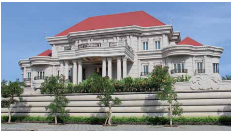
An Try's House

On the corner of Norodom Boulevard and Street 380 stands a big private residence in the style of a European castle. The house is surrounded by secrecy: no one seems to know who exactly the owner is.