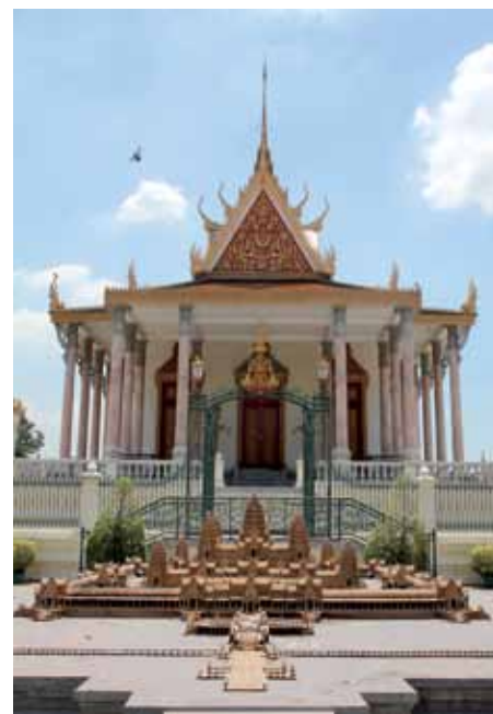
Silver Pagoda inside the Royal Palace

Preah Tineang Chanchhaya (Chanchhaya pavilion) serves as a stage for the Royal Ballet, as a site for the King to address the crowds and as a place to hold state and royal banquets. The current pavilion is the second incarnation of the Chanchhaya pavilion; it was constructed in 1913-14 under King Sisowath to replace the original wooden building which was constructed under King Norodom in 1866.