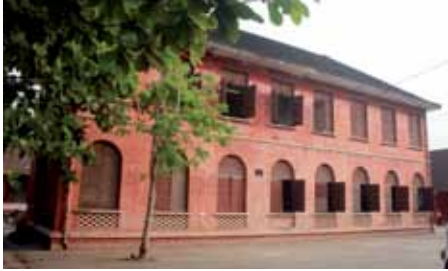
Royal University of Fine Arts

school that is located behind the museum and today is known as Royal University of Fine Arts. The museum was supposed to provide original examples of ancient Khmer Art to the students in their pure and untainted form. “The first purpose of this school was to serve the needs of the Royal