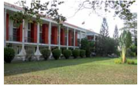
National Technical Training Institute