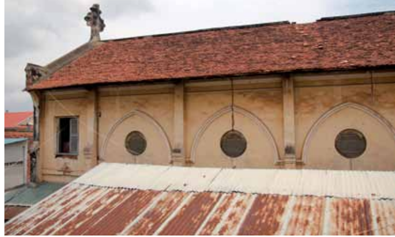
Mission des Sœurs de Providence Hospice

Entering through the main entrance, we can see a beautiful tiled floor that leads towards the altar in the transept, where the priest held service for the Christian followers. On both sides of the aisles, there were seats standing on floor tiles with a pattern that is different from that of the tiles in the aisles and is adorned