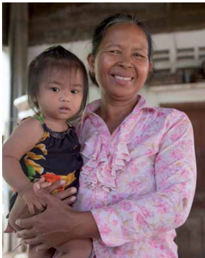
Resident at One Hundred Houses since 1979

safe and orderly. She rarely hears about robberies or burglaries in the village. However, her family will leave soon, because her house is not comfortable anymore. She explains: “If we would have kept the building in its original state, it would be great to live here.” She says that during the rainy season every house has to have a pump to drain the garden. Alternatively, they have to put sand sacks around their plot of land.