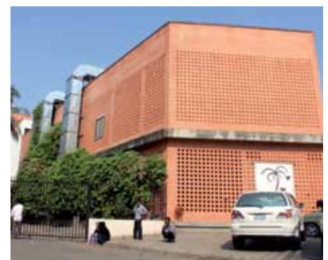
Kantha Bopha Hospital

The hospital’s walls are out of open bricks