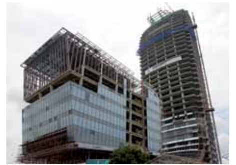
Vattanac Capital Tower

Vattanac Capital Tower is promoted by its builders as one of the highest and most luxurious towers in Phnom Penh – once it is finished. The high rise consists of two towers and a glass and steel podium. Tower 1 is a skyscraper with 39 floors, Tower 2 has six floors. The height of the building is 187.3 meters. Vattanac Capital Tower will include the headquarters of the Vattanac Bank, trading floors, offices, 29 elevators and five-star serviced apartments.