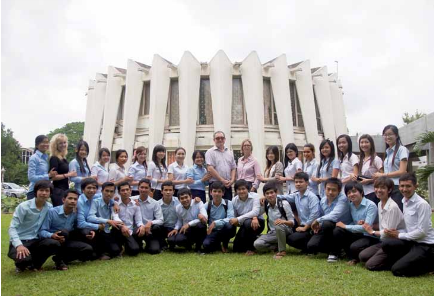
The "Stha Patyakam" magazine team in front of Vann Molyvann's French Library on the RUPP Campus