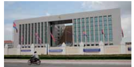
Council of Ministers

The Office of the Council of Minister is the secretariat office of the Royal Government. It was completed after two years of construction, and official opened in April 4, 2009. The building was donated by the government of the People’s Republic of China. It costs 32.9 million dollar and was