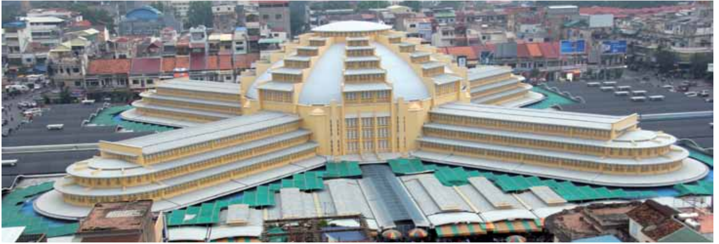
Psar Thmey, Central Market

signpost that was officially inaugurated in July 2011 by the Phnom Penh Municipality north of Wat Phnom. On the flank of Wat Phnom hills at its northern edge, there is the Wat Phnom Museum of Art. The museum opens every day from 7 am to 6 pm for local and international tourists who want to see sculptures and handicrafts from art works to silk. There are also pictures from Khmer history.