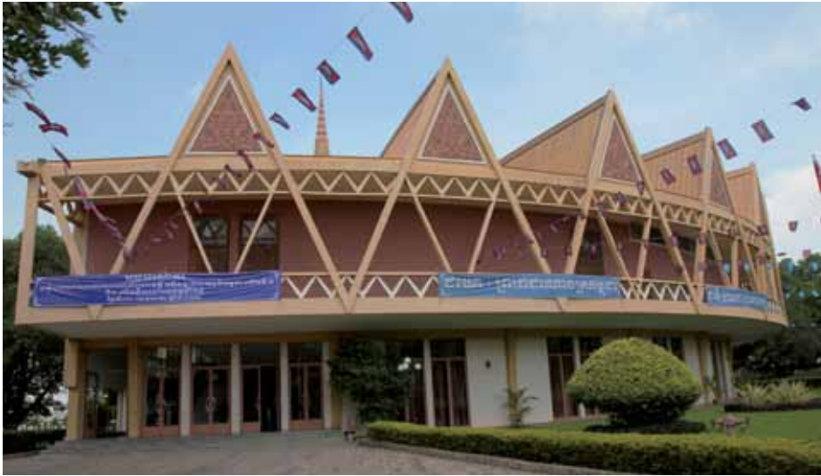
Chaktomuk Conference Hall

until today. Some of the buildings have been rebuilt, but in their original style.