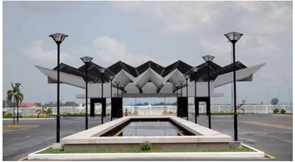
Old Airport, VIP Canopy

air circulation. When the houses are above ground level, the air can move freely under the floor, so people can get fresh air and feel comfortable. It also helps to keep dangerous animals such as tigers, snakes or foxes out of the house. The space under the house can be used to keep rice paddy and tools.