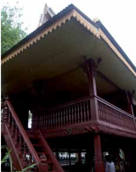
Traditional Wooden House

In Cambodia, building houses over the ground offers a lot of advantages. During the monsoon season they protect the inhabitants from floods. Another benefit is