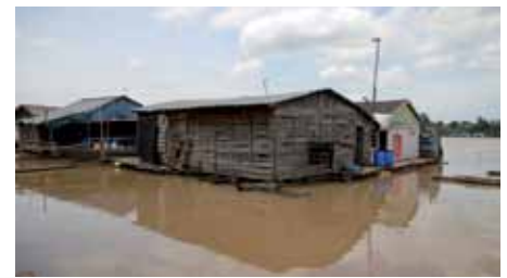
Floating House at Tonle Sap

Traditionally, there are two types of Cambodian houses: those on land and those on water. They are very different from each other in terms of architecture. Mostly fishermen and their families live in floating houses on the water. Today, the only Cambodians who live in floating houses can be found on the Tonle Sap lake. The floating houses that can be seen on the Tonle Sap river in Phnom Penh along National Road 1 and 5 belong to Vietnamese and Cham people. Many of them came to Cambodia as immigrants and therefore have no land of their own.