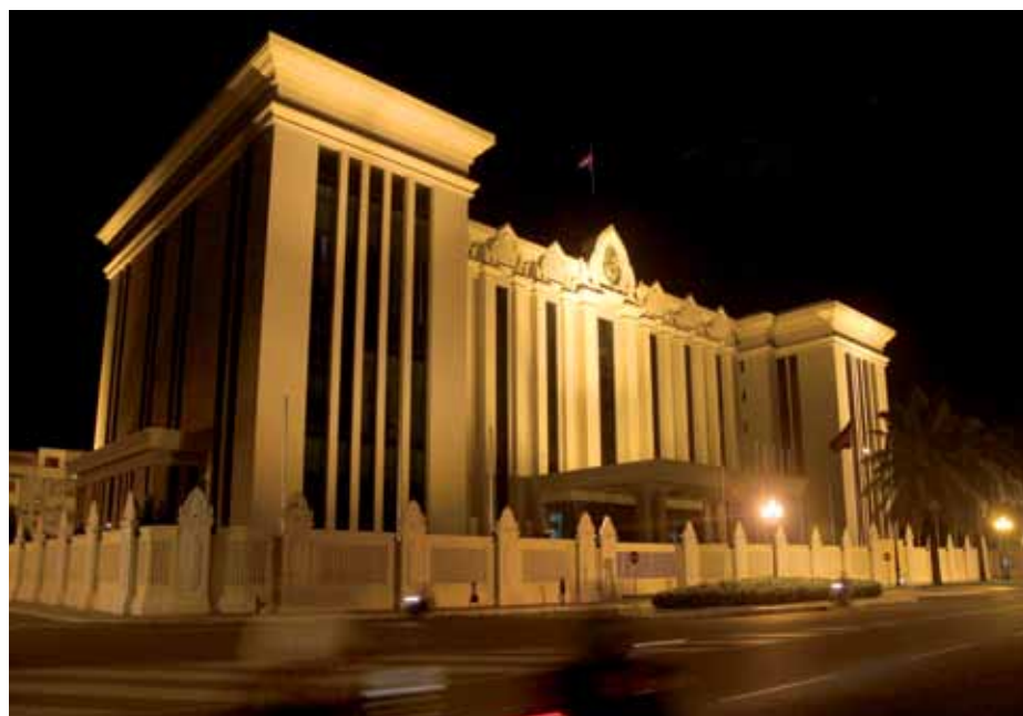
The Office of the Prime-Minister