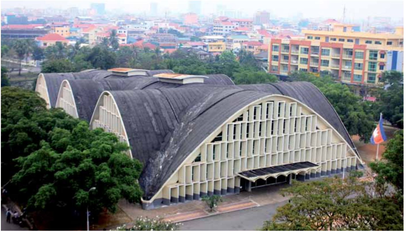
Auditorium of the Royal University of Phnom Penh

point out in their book Building Cambodia: New Khmer Architecture 1953-1970 , the most interesting aspect of this building is the technical prowess required to build it, because the whole weight of the building is borne by a few columns.