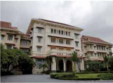
Raffles Hotel Le Royal

Raffles Hotel Le Royal is a rare example of a historic, yet timelessly sophisticated building in Phnom Penh. It was built in 1929 during the French colonial period by French architect Ernest Hébrard. It is designed in French style and luxuriously decorated with Cambodian and French furnishings. The building is typical of the French colonial style, but the roof is in traditional Khmer style. The Royal underwent a number of name changes: At its inception in 1929 it was named “Le Royal”. From 1970 to 1975, it was known as Le Phnom. In 1979, the hotel reopened after the Pol Pot regime as “Hotel Samakki”. This name was used until Norodom Sihanouk was reinstalled as king in 1993, when the hotel changed its name back to “Hotel Le Royal”.