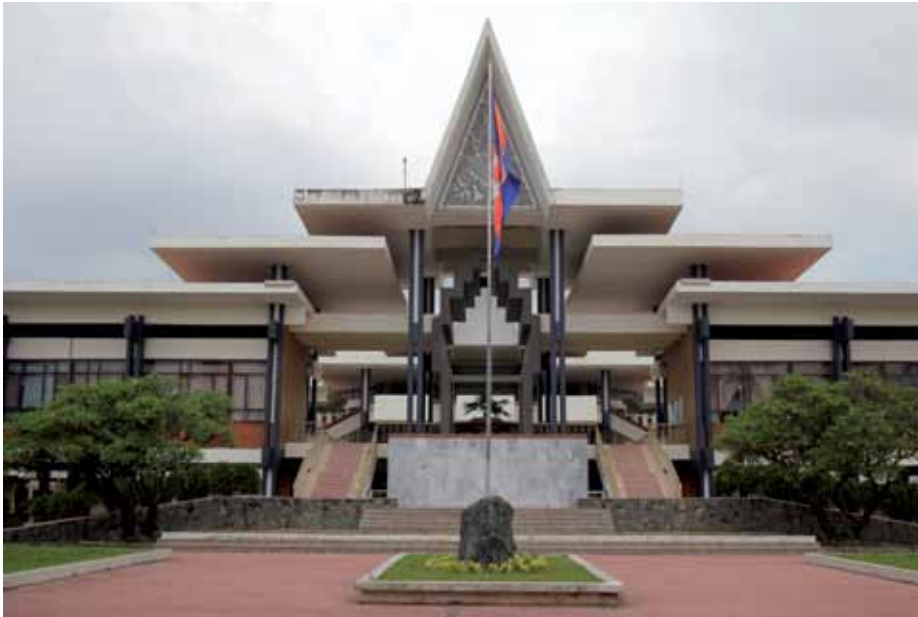
Royal University of Phnom Penh, Campus II

The Campus 2 of the Royal University of Phnom Penh was built between 1989 and 1991 with the support of the Vietnamese Communist government. It is located on five hectares of land on Russian Boulevard and has a lot of dark red brick walls and bridges. Apart from the class rooms of the Departments of Geography, History and Sociology, there is also the Royal Academy