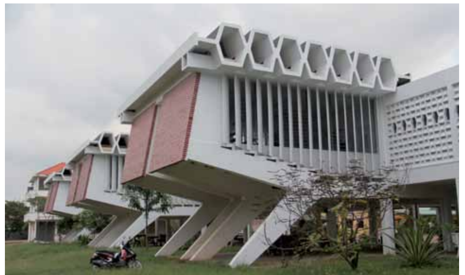
French Department, Institute of Foreign Languages