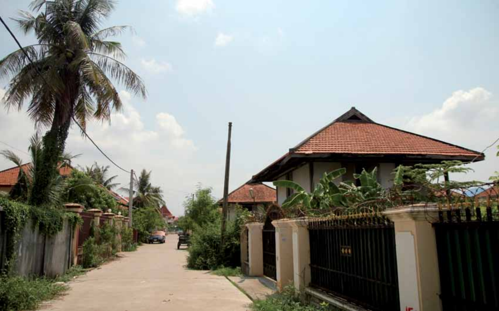
One Hundred Houses neighborhood in 2012