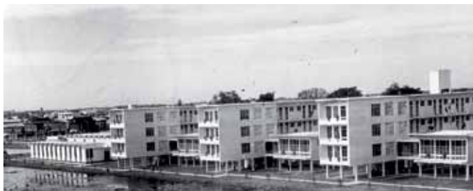
Borei Keila in the 1960s