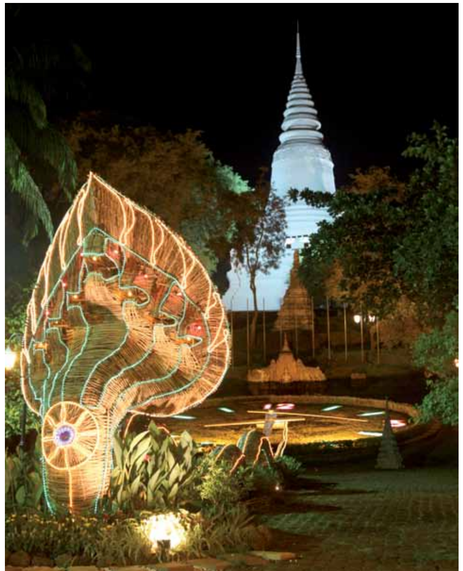
Wat Phnom in the year of the dragon 2012

The distance from the capital city to the provinces in Cambodia is measured from the