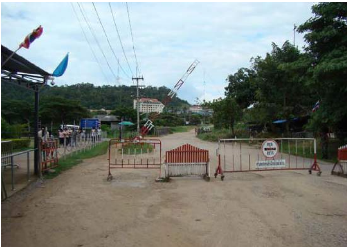
In Cambodia, the first developments to pop up in even the most remote border towns are often casinos. In this photo of the sleepy Thai-Cambodian frontier post, you can see the big new pink-colored casinos rising prominently above everything else in Pailin.