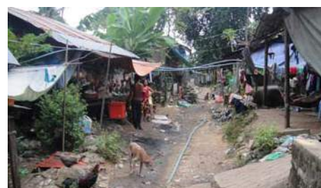
BEFORE and AFTER : The same road in Mlob Dong Community before upgrading (above) and after (below).