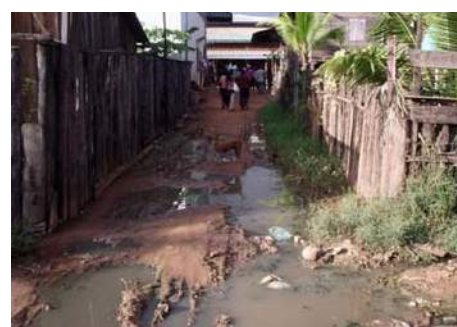
BEFORE : (above) This is one of the roads in the Samrong Thmey community, before upgrading.