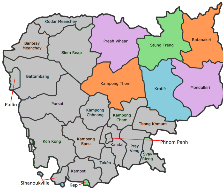
Figure 1: Provinces of Cambodia

Project. The ESMF will include necessary guidance to ensure that during project implementation all sites and communities, for which the project beneficiaries are selected would be in accordance with the law and with ESF requirements. Direct LASED III beneficiaries would approximate 15,000 rural households. Benefits from improved infrastructure availability and usage would accrue to a broader population, beyond the targeted households in the project areas.