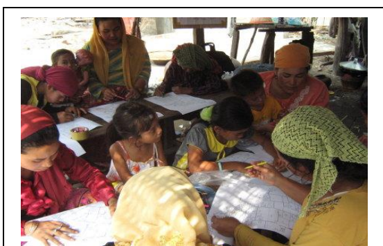
Photograph 1. Children's group learn how to read a map

Source: Sahmakum Teang Tnaut, March 2010