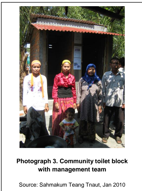
Photograph 3. Community toilet block with management team

daily tides and improving hygiene and the environment. Above all, the infrastructure projects facilitated an open communication between STT, residents and the Sangkat and this reassured residents about the mapping project.