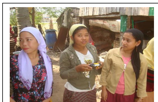
Photograph 2. Photovoice children's group