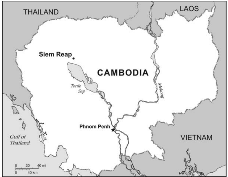
FIGURE 1 Map of Siem Reap, Cambodia