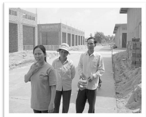
In the relocation site, a family preparing to relocate inspected the new housing being built for them (Author’s photo, January 2006)