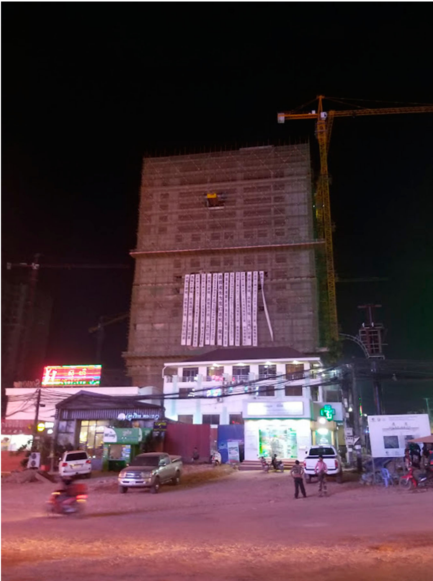
Figure 1. Written in both Chinese and Khmer, the banners on the building read: “Give us back the money of our salary, give us back our blood and sweat money, allow us to go home,” “Work stopped two months ago, we haven’t been paid for four months, who is going to help us?,” “Governor Kouch, please support us peasant workers,” and “The Chinese and Cambodian governments are our strongest support.”

of Chinese migrant workers within China over the past couple of decades, but in the moral terms usually employed by workers in China who have been laid off by SOEs. 21