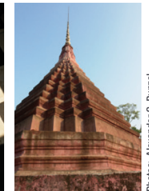
Stupa Wat Kamphaeng