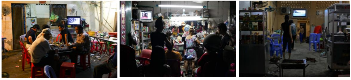
L-R: TV playing Aziza students film in the chess café; in the hairdressers; restaurant

This program was the most substantial engagement with public and shared spaces in and around the Building. The Sa Sa gallery hosted an exhibition, however other spaces also became exhibition spaces. Video installations were placed in numerous businesses on the ground floor. A local café became a cinema showing films made by the film school participants, as well as films by Cambodian and international filmmakers, and one of the Aziza School classrooms became the site for a multi-screen installation work. Most of the films that were featured in the café cinema over the course of a 7-day mini film festival were focused on people from the Building and life in and around the Building. Participants in the films and the filmmakers presented and discussed their stories. As many stories, materials and other resources as possible that were available within the community were used in staging the program. Video works that were produced were played on TVs and DVDs borrowed from individuals and businesses throughout the Building. The cinema screen was made by Aziza School students, graphic design was done by Building based designers, promotion of the event within the Building community was by community members who were also guides for outside guests enabling them to navigate the different sites of the exhibition. Even community clean up and maintenance works were organised by community members.