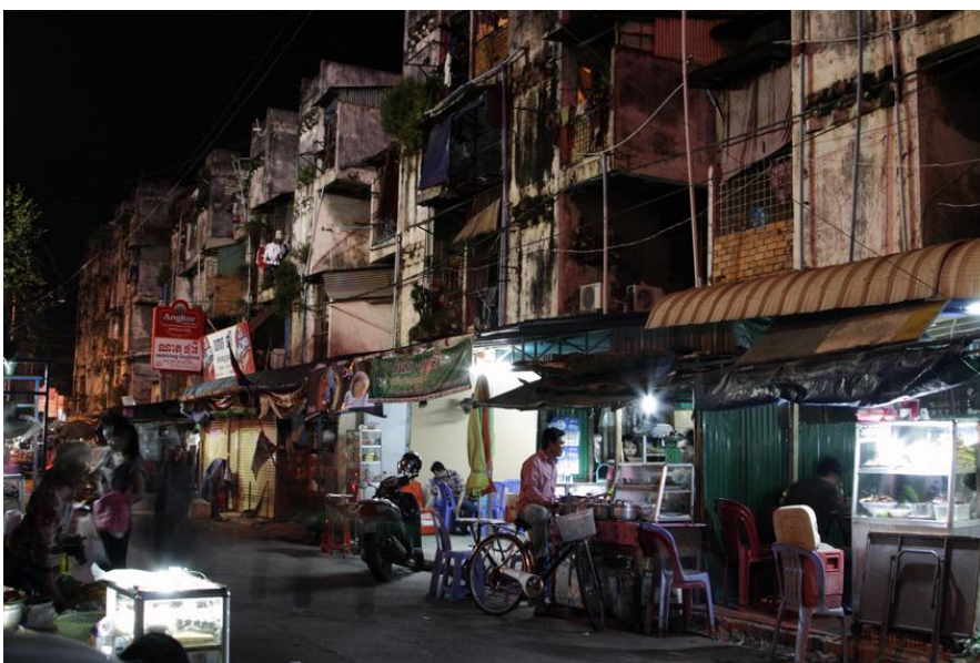
The Building, 2014.