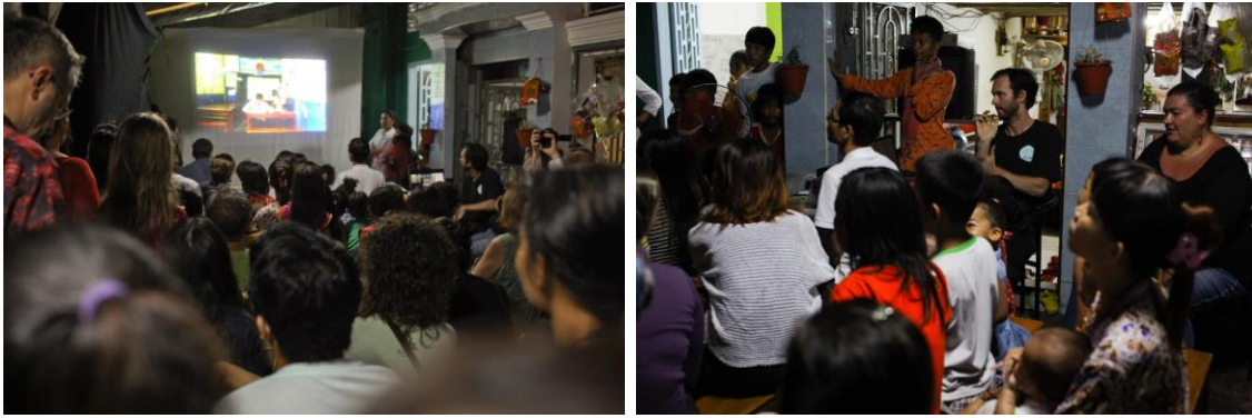
L-R: the café cinema