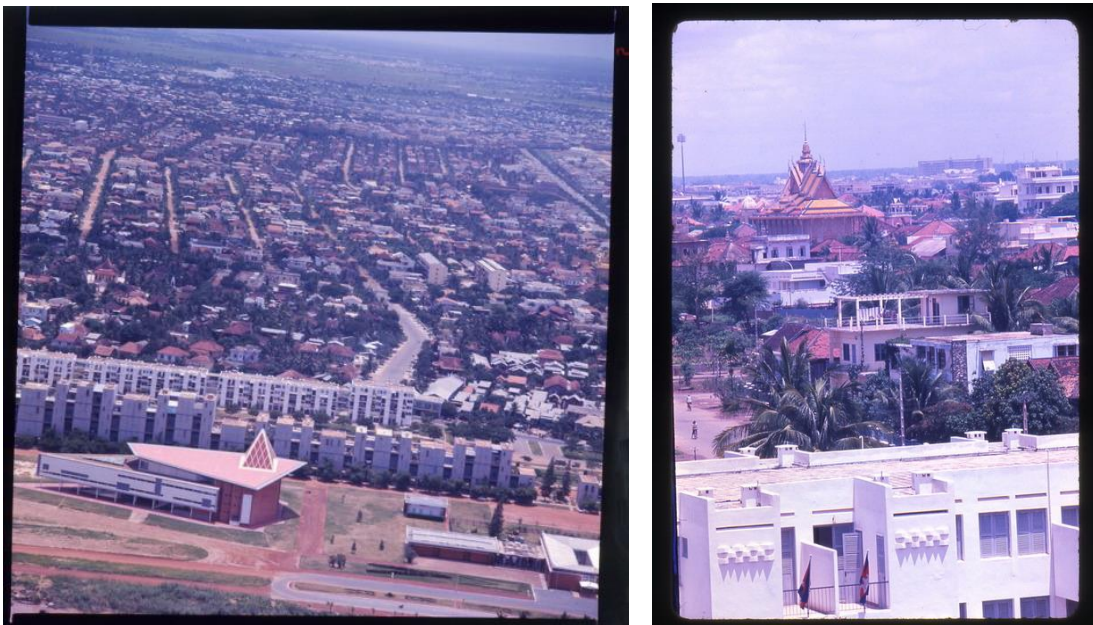
Images of the White Building and the newly completed Front de Bassac development, 1963, in Phnom Penh, Cambodia. The image on the left shows the National Theatre with its iconic pyramid roof. The image on the right features the White Building in the bottom of frame and Wat Langka behind.

A centrepiece of the response to the “problem of the urban population” was the ambitious Bassac River Front cultural complex that lay on reclaimed land along the Bassac river.