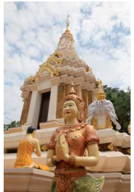
Wat Botum Vathey

W at Botum Vathey was established in 1442 by King Ponhea Yat. “Wat Botum Vathey, whose original name was Wat Khpop Ta Yang, was built on a raised ground,” says Chem Thyrack, deputy chief