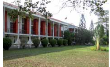
National Technical Training Institute