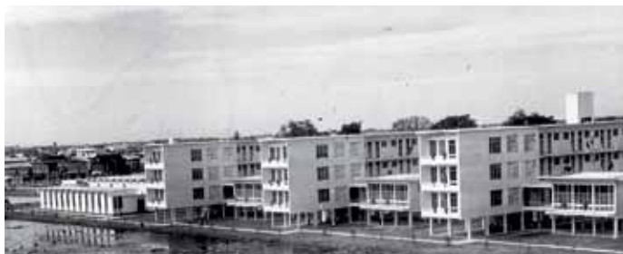
Borei Keila in the 1960s