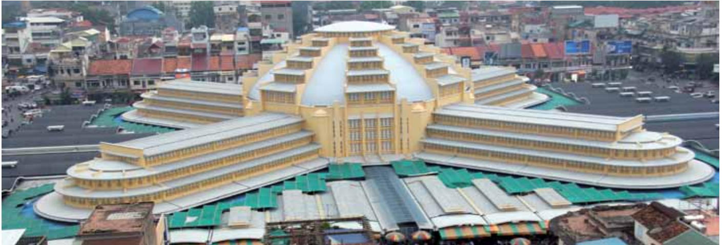
Psar Thmey, Central Market

signpost that was officially inaugurated in July 2011 by the Phnom Penh Municipality north of Wat Phnom. On the flank of Wat Phnom hills at its northern edge, there is the Wat Phnom Museum of Art. The museum opens every day from 7 am to 6 pm for local and international tourists who want to see sculptures and handicrafts from art works to silk. There are also pictures from Khmer history.