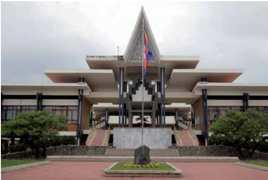
Royal University of Phnom Penh, Campus II

The Campus 2 of the Royal University of Phnom Penh was built between 1989 and 1991 with the support of the Vietnamese Communist government. It is located on five hectares of land on Russian Boulevard and has a lot of dark red brick walls and bridges. Apart from the class rooms of the Departments of Geography, History and Sociology, there is also the Royal Academy