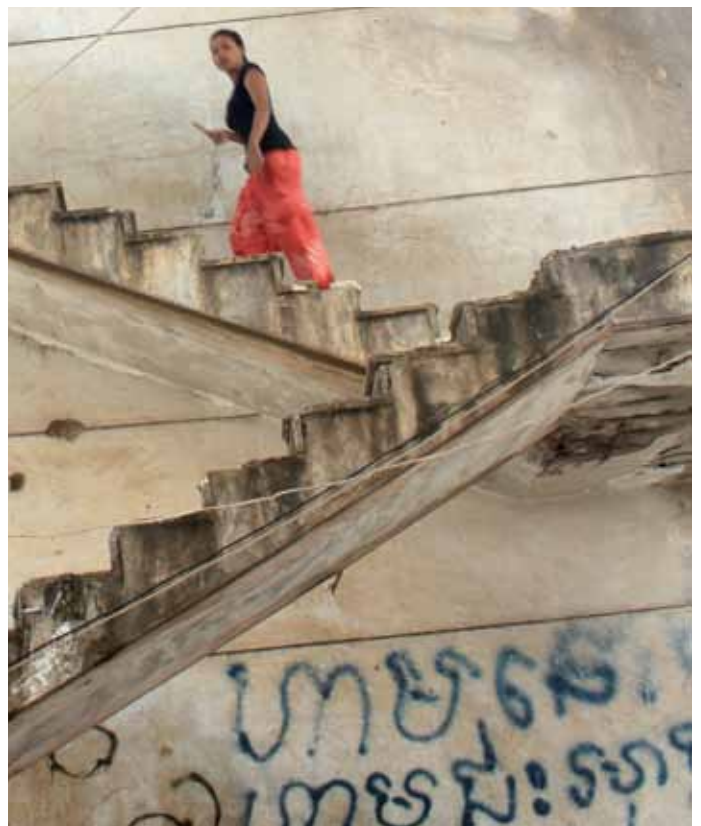
The slum of Borei Keila today